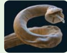
Adult A. vasorum lungworm These live in the heart and pulmonary arteries

Lungworm infestation, caused by the parasite Angiostrongylus vasorum is something that all dog owners should be aware of. Angiostrongylus vasorum can cause a wide range of symptoms – some severe, including coughing, lethargy, fits and blood clotting problems. However other pets may show no obvious signs of problems.